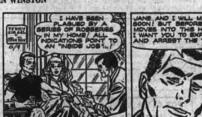
BY JERRY SIEGEL AND MIKE ROY