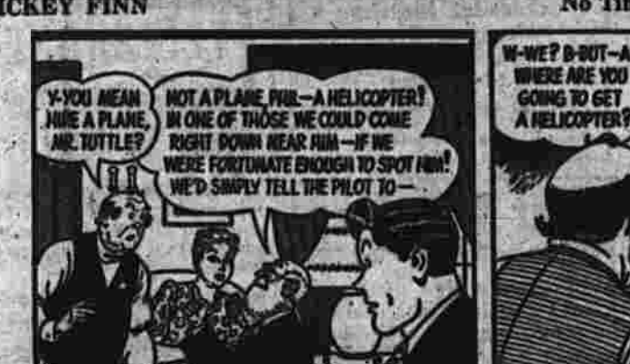
BY LANK LEONARD