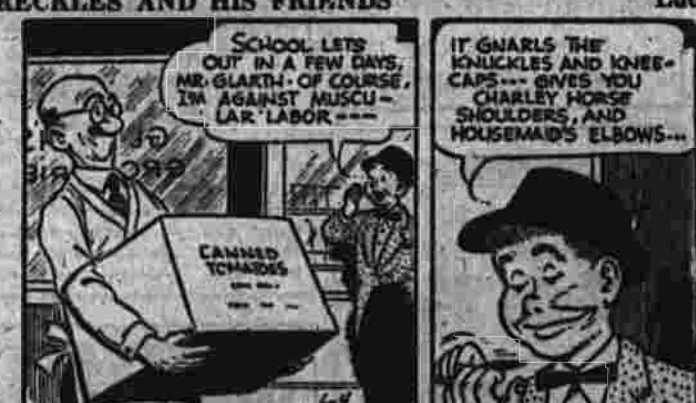
BY MERRILL C. BLOSSER