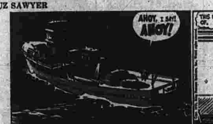
BY ROY CRANK