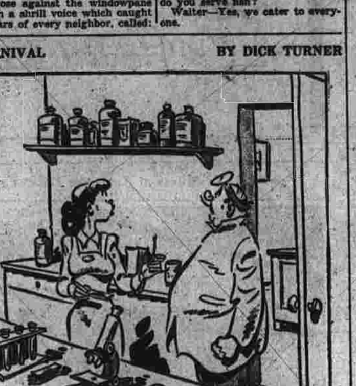
BY DICK TURNER